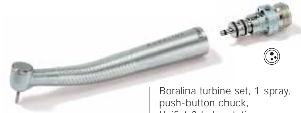
Boralina turbine set, 1 spray, push-button chuck, Unifix* 3-hole rotating quick connect coupling REF 1700200-001

Standard version with single spray. Speed up to 310 000 rpm on ball-bearings. Push-button chuck. Able to withstand multiple sterilizations. Required air pressure: 2.5 to 2.7 bars (36.28 to 39.18 psi). Lubrication with Lubrimed medical grease or Lubrifluid spray. Unifix 3- or 4-hole rotating quick connect coupling.