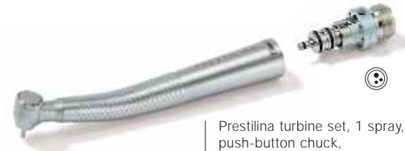
Pretilina turbine set, 1 spray, push-button chuck, Unifix* 3-hole rotating quick connect coupling REF 1700198-001

Required air pressure: 2.2 to 2.5 bars (31.9 to 36.3 psi). Lubrication with Lubrimed medical grease or Lubrifluid spray. 3- or 4-hole Unifix rotating quick coupling.