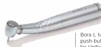
Bora L turbine with light, 3 sprays, push-button chuck, for Unifix* rotating quick connect coupling REF 1600382-001