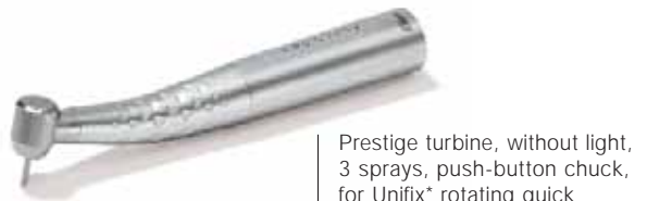
Prestige turbine, without light, 3 sprays, push-button chuck, for Unifix* rotating quick connect coupling REF 1600379-001