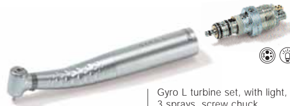
Gyro L turbine set, with light, 3 sprays, screw chuck, Unifix* electrified 4-hole rotating quick connect coupling, fitted with air non-return valve REF 1700190-001

Unifix quick coupling with light equipped with air non-return valve.