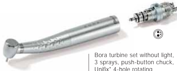
Bora turbine set without light, 3 sprays, push-button chuck, Unifix* 4-hole rotating quick coupling REF 1700188-001