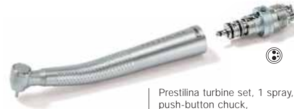
Pretilina turbine set, 1 spray, push-button chuck, Unifix* 4-hole rotating quick connect coupling REF 1700199-001