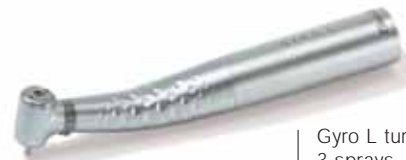
Gyro L turbine, with light, 3 sprays, screw chuck, for Unifix* rotating quick connect coupling REF 1600378-001