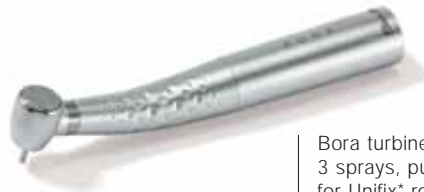
Bora turbine without light, 3 sprays, push-button chuck, for Unifix* rotating quick coupling REF 1600381-001