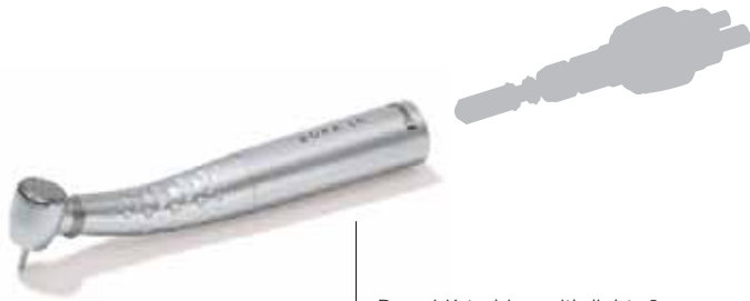
Bora LK turbine with light, 3 sprays, push-button chuck, for MULTiflex® Kavo® rotating quick connect coupling REF 1600155-001

The Bora LK turbine is distinguished from Bora L by its MULTiflex® / Kavo® type coupling. On this model, the light bulb is located in the coupling. If you have the MULTiflex® quick-connect coupling, you can connect the Bora LK turbine at no extra cost.