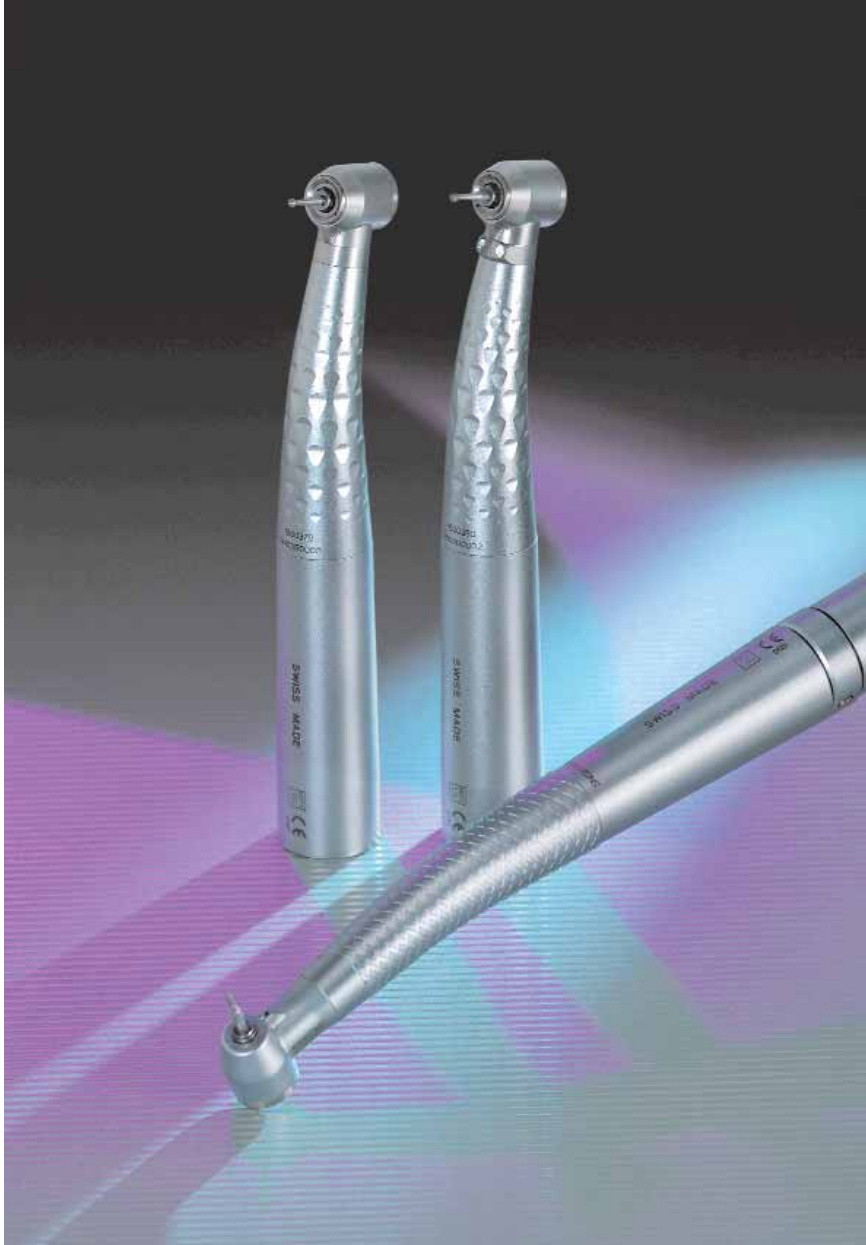
Prestige and Prestilina turbines