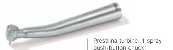
Pretilina turbine, 1 spray, push-button chuck, for Unifix rotating quick connect coupling REF 1600372-001