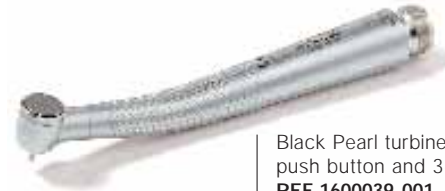
Black Pearl turbine Eco, push button and 3-hole fitting REF 1600039-001

Economical ball-bearing turbine, speed up to 310 000 rpm. 1 spray. Recommended air pressure: 2.5 bars (36.26 psi). Push button. Lubrication with sterilizable Lubrimed medical grease or Lubrifluid spray. Autoclavable to 136°C (277°F). Complies with ISO 7785.