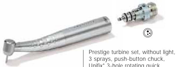
Prestige turbine set, without light, 3 sprays, push-button chuck, Unifix* 3-hole rotating quick connect coupling REF 1700185-001