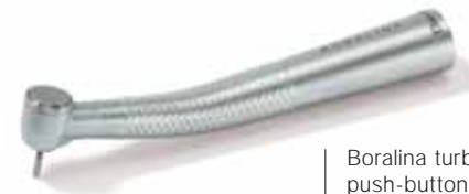
Boralina turbine, 1 spray, push-button chuck, for Unifix* rotating quick connect coupling REF 1600373-001