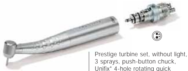
Prestige turbine set, without light, 3 sprays, push-button chuck, Unifix* 4-hole rotating quick connect coupling REF 1700186-001