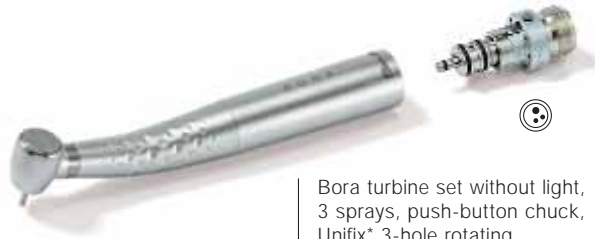
Bora turbine set without light, 3 sprays, push-button chuck, Unifix* 3-hole rotating quick coupling REF 1700187-001