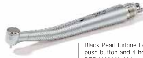
Black Pearl turbine Eco, push button and 4-hole fitting REF 1600040-001