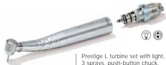
Prestige L turbine set with light, 3 sprays, push-button chuck, Unifix* 4-hole electrified rotating quick coupling fitted with air non-return valve REF 1700184-001

Ball-bearings turbine with compact head, for delicate work. Allows access to the most difficult places. With a beaded profile for easy maintenance. Speed up to 335 000 rpm. Optimum cooling action provided by three separate air/water sprays. Anti-heat push-button chuck. Glass rods and water non-return valve able to withstand multiple sterilizations. Recommended air pressure: 3.25 bars (47.17 psi). Lubrication with Lubrimed medical grease or Lubrifluid spray. Unifix quick coupling with light fitted with air non-return valve.