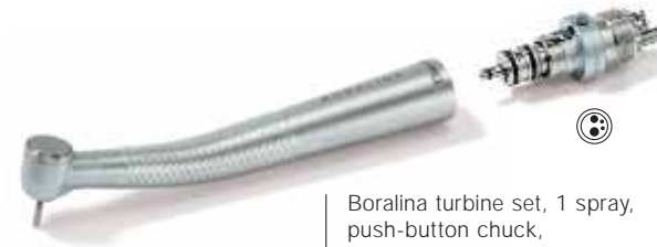
Boralina turbine set, 1 spray, push-button chuck, Unifix* 4-hole rotating quick connect coupling REF 1700201-001